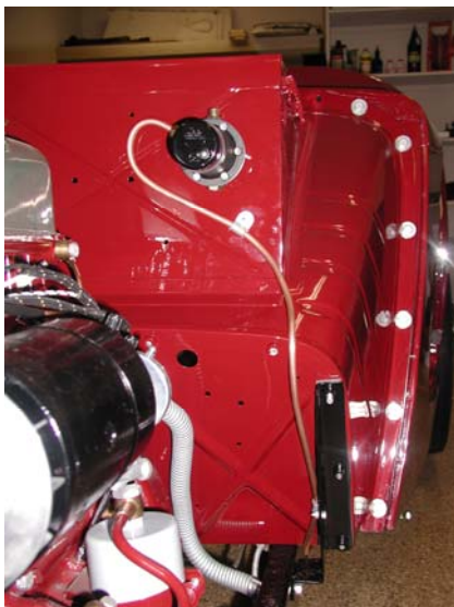
9 – Final clip on battery box