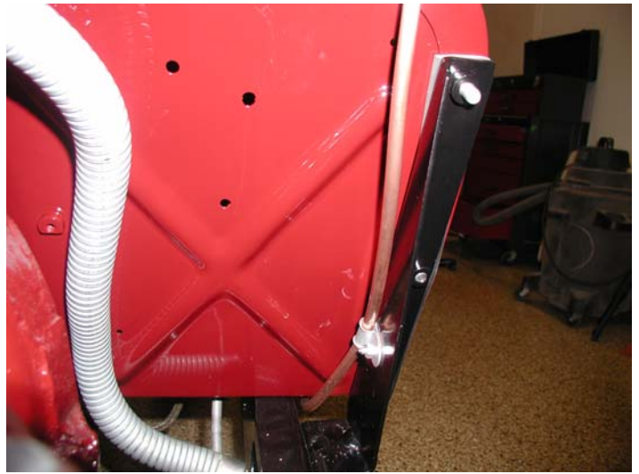
8- All clips are held by 2BA setscrew