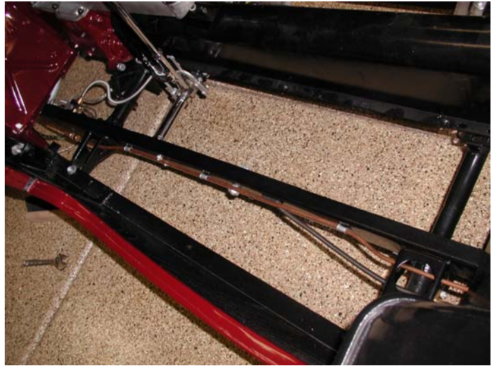
6 – Total of 7 clips from tank to pump