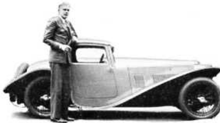
The figure is admittedly tall and slightly over-emphasises the extremely low overall height of the car.

A Smart and Roomy New Special Coupé on the M.G. Magna Chassis, with Over- all Height of Only Four Feet One and a Half Inches