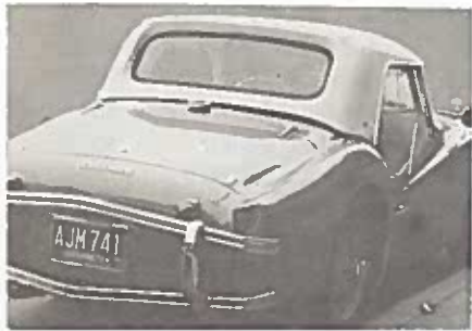
TR. 2 & 3 $189.00