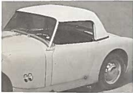
SPRITE MK. I $154.00