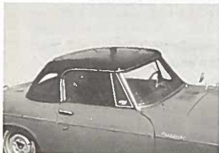
DATSUN "FAIRLADY" $198.00