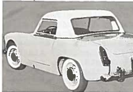
M. G. MIDGET & SPRITE MK. II LONG $159.00