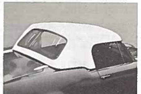
ALFA ROMEO GULIA - GIULIETTA $188.00