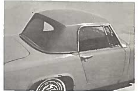
M. G. MIDGET & SPRITE MK. III $175.00