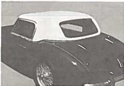
HEALEY-SIX 57 TO 62 4 SEATER $198.00