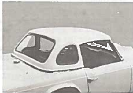
TR. 4 - TR. 4-A $198.00