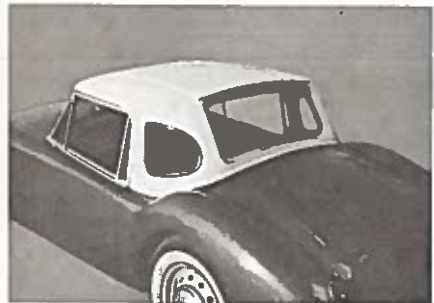
M. G. A. $189.00