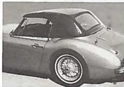
AUSTIN HEALEY 3000 ROLL UP $198.00