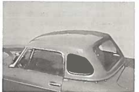
M. G. B. $198.00